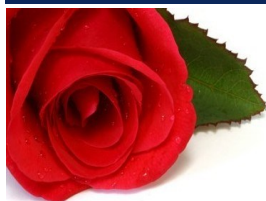
Now in God's hands